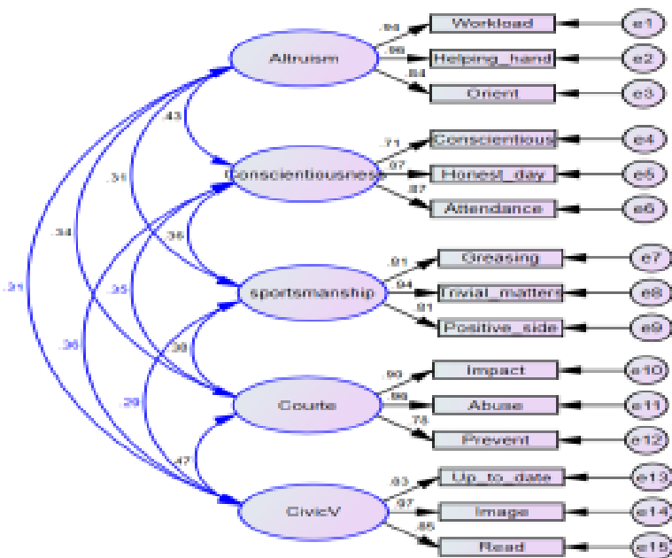
Fig 4.2: CFA on OCB

Note: CMIN= Chi-Square; DF = Degrees of freedom; SRMR = Standardized Root Mean Square GFI = Goodness of Fit Index; TLI = Tucker Lewis Index; CFI= Comparative Fit Index; RMSEA = Root Mean Square Error of Approximation