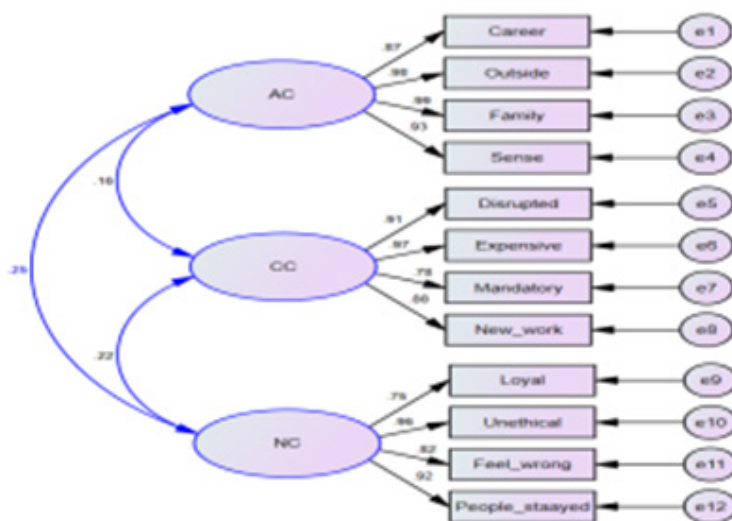
Fig 4.1: CFA on Organizational Commitment

Note: CMIN= Chi-Square; DF = Degrees of freedom; SRMR = Standardized Root Mean Square GFI = Goodness of Fit Index; TLI = Tucker Lewis Index; CFI= Comparative Fit Index; RMSEA = Root Mean Square Error of Approximation