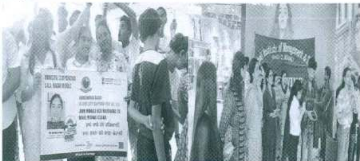
GJIMT Mohali Participated in Flash Mob Organised by Mohali Eco Warriors under Indian Swachhata League 2.0