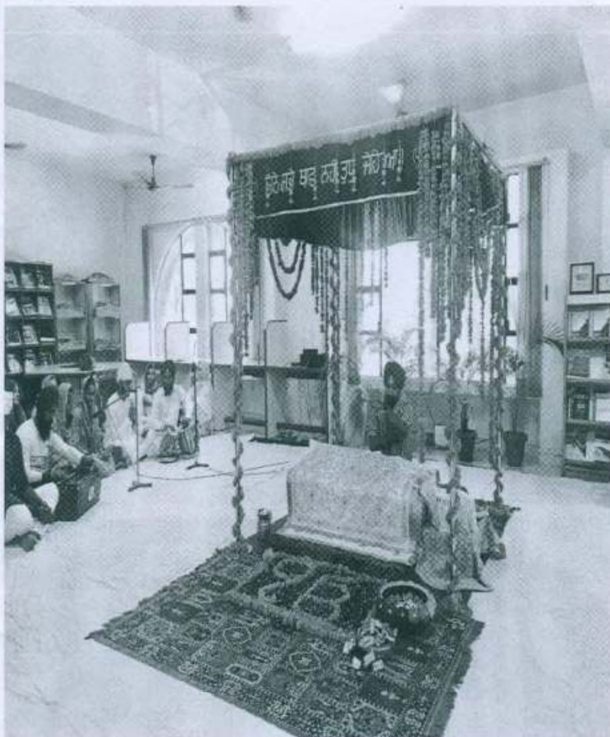
SUKHMANI SAHIB PATH ORGANIZED BY GJIMT