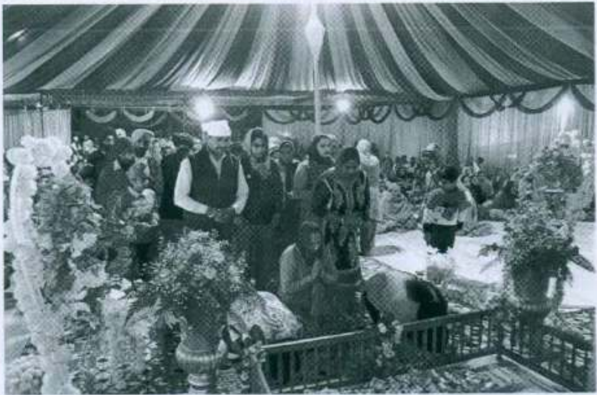
KIRTAN ORGANIZED BY GJIMT AT GLOBAL SCHOOL PARKING