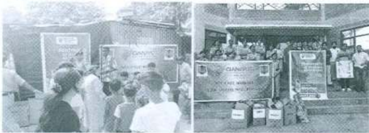
SHOE DONATION DRIVE - "FOOTPRINTS OF KINDNESS" AUGUST 21-28, 2023