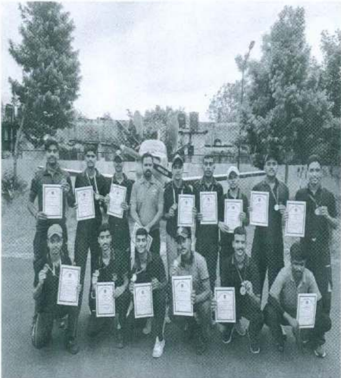
COMBINED ANNUAL TRAINING CAMP, GJIMT NCC CADETS' PARTICIPATION IN CATC-163 AT ROPAR