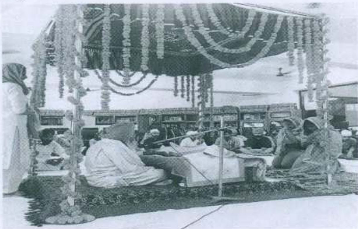
DARBAR ORGANIZED BY GJIMT on 18 th AUGUST 2023