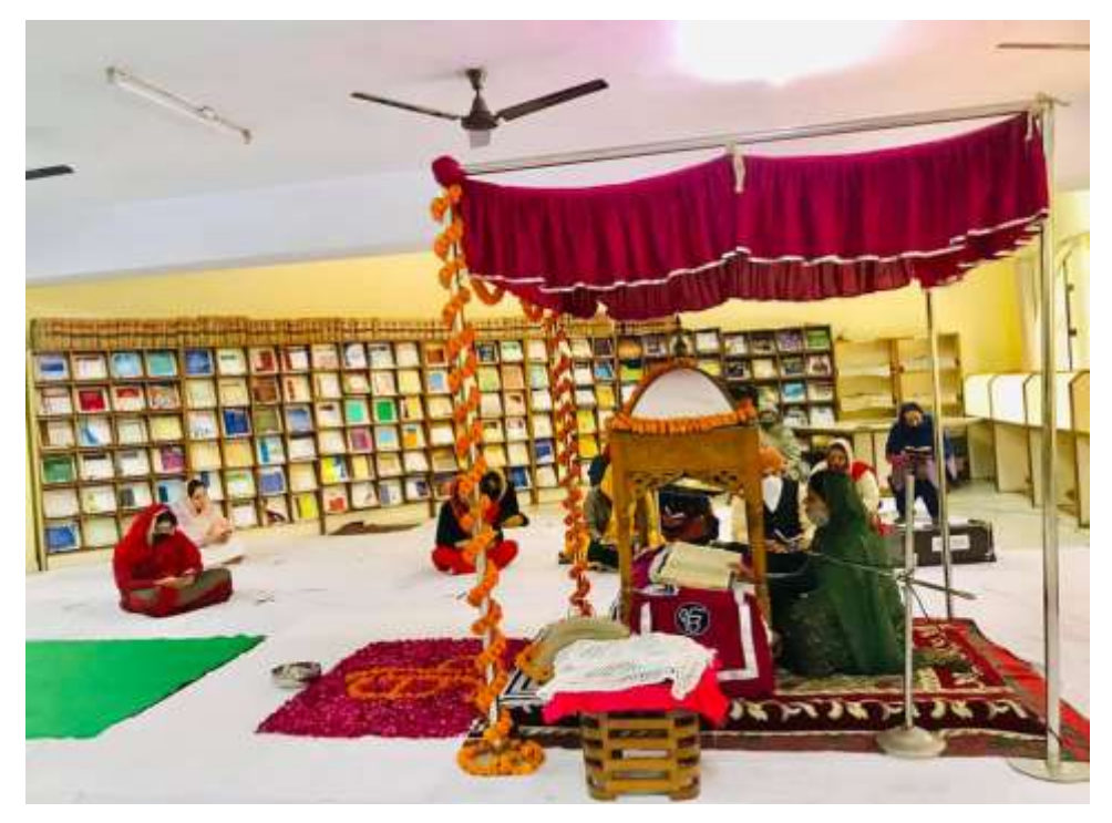
SUKHMANI SAHIB PATH- 23<sup>RD</sup> DEC 2020