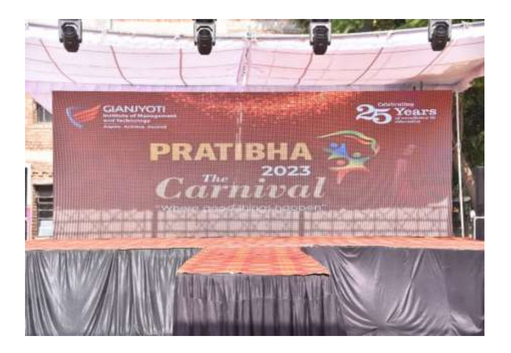
PRATIBHA: A YOUTH FESTIVAL- 4<sup>TH</sup> NOV 2023