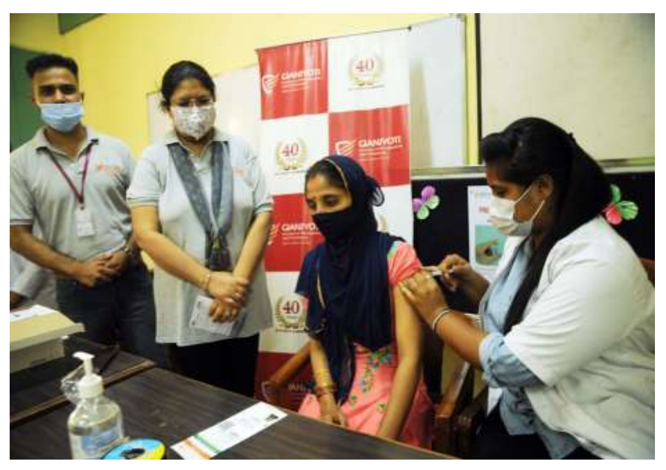
VACCINATION DRIVE DURING COVID-19 PANDEMIC- 10<sup>TH</sup> JULY 2021 AND 17<sup>TH</sup> JULY 2021