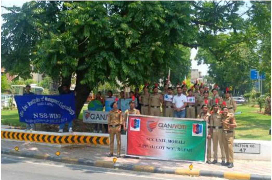
WORLD ENVIRONMENT DAY -5<sup>th</sup> June 2023