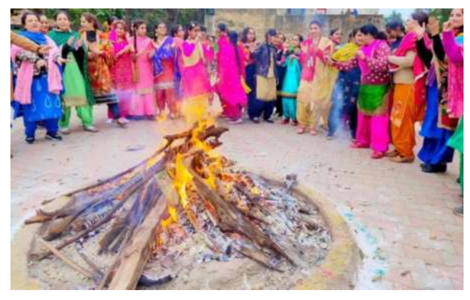
LOHRI CELEBRATION- 13<sup>TH</sup> JAN 2024