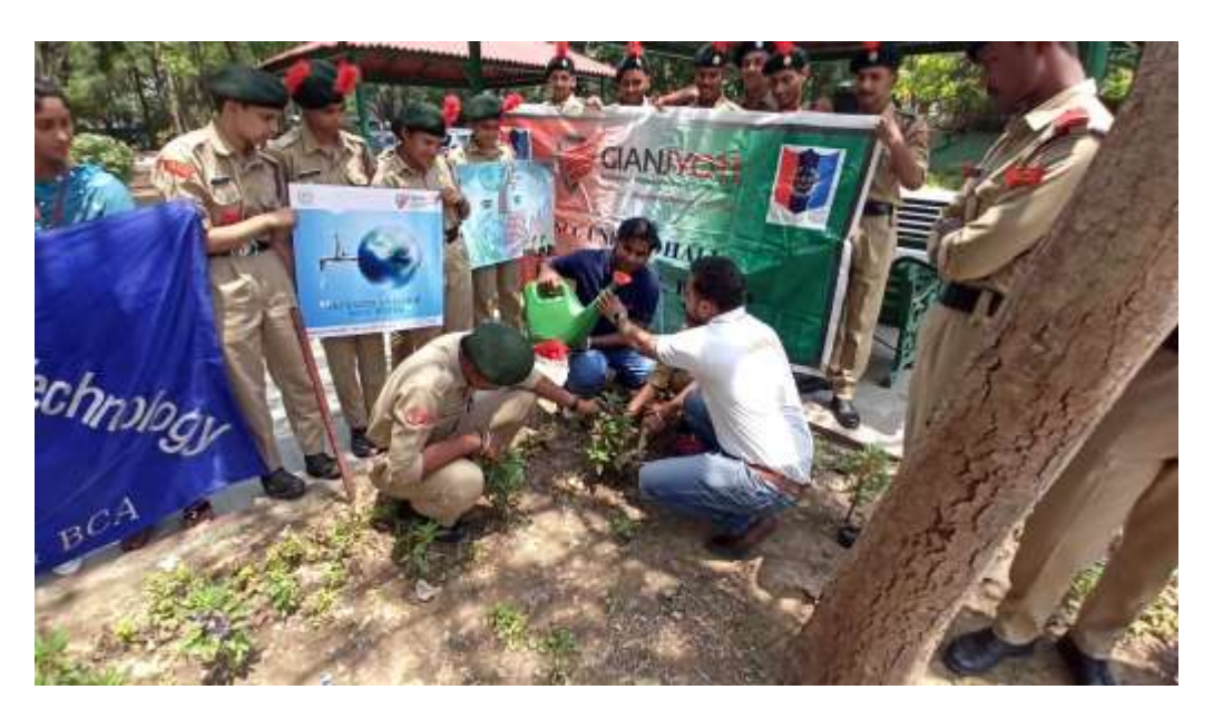
PLANTATION DRIVE BY NCC UNIT- 1st Oct 2023