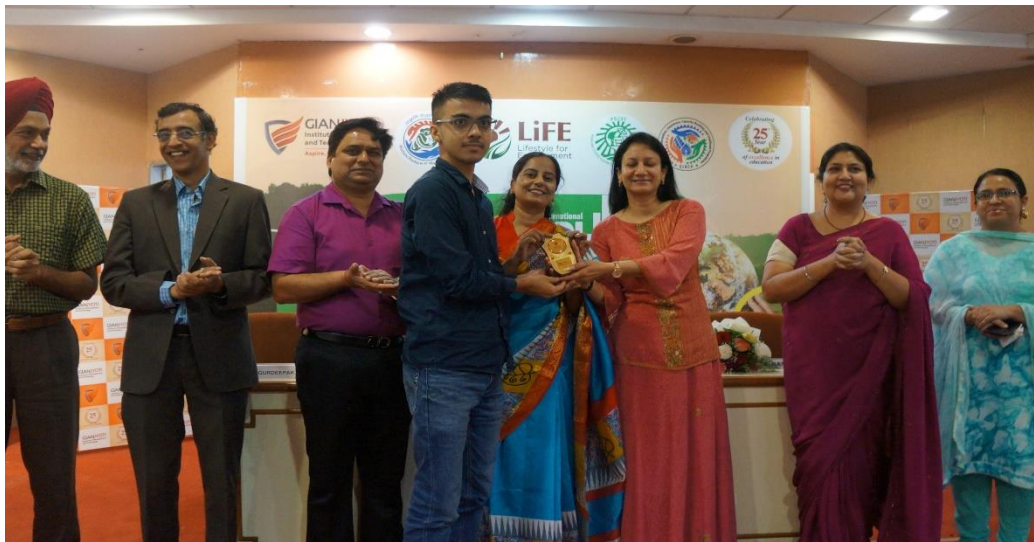
Prize distribution to the Winners of Case Study