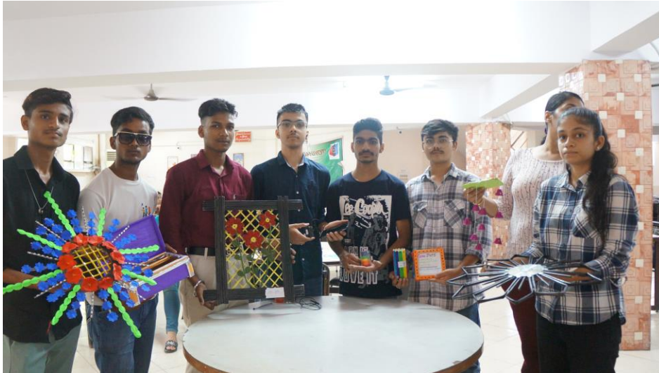
Best Out of Waste Wares

Some of the photographs of the events are: