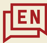
SPOKEN ENGLISH & PUBLIC SPEAKING